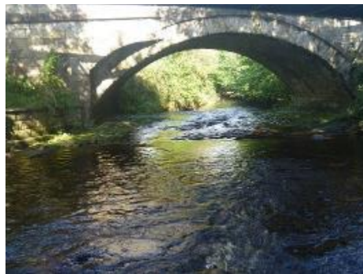
The newer structure built over an earlier bridge from Artlebeck

Artlebeck bridge has along historic legacy and is a grade 11 listed heritage. It is described by Historic England as: 'Bridge over Artle Beck, c.1800. Punched sandstone blocks. Single segmental arch with band around voussoirs. String course below solid parapet with rounded coping.' The village website https://www.catonvillage.org.uk/history draws attention to the bridges importance: 'This road through Caton became the main road north, travelled by kings and armies. James I had to cross Artle Beck Bridge in 1618 and it was so dilapidated that he was afraid to cross, and he ordered that it be rebuilt, costing the locals £100!' Artlebeck bridge is a delightful stone bridge which features in all views towards Brookhouse from Beckside.