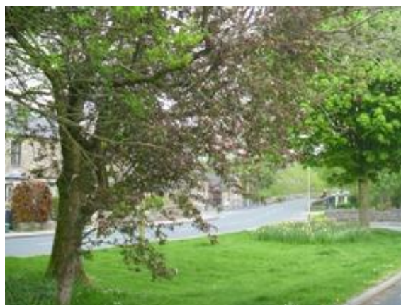
North end daffodils