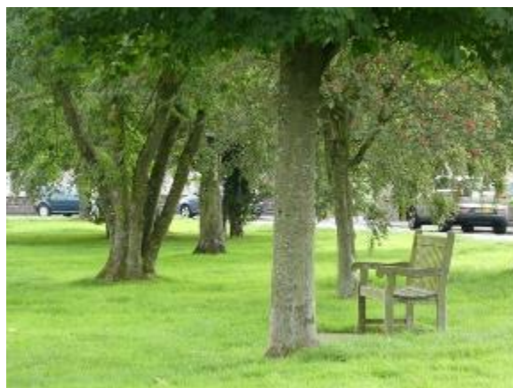
A place to rest and enjoy the tranquility