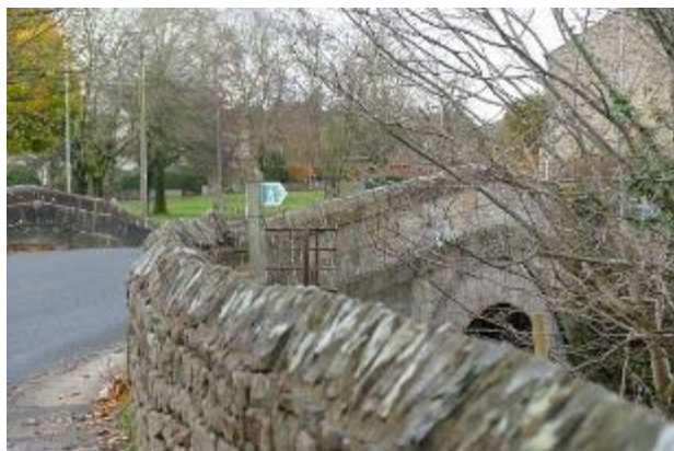
Beckside looking north viewed as a pedestrian from Artlebeck bridge footpath between Brookhouse Road and A683