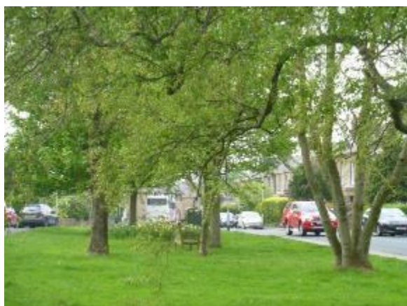
Daffodils in the distance beyond the bench

Comment: "The daffodils are very attractive in the spring. We would hate to lose those ...."