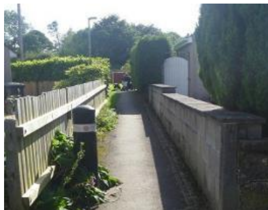
Footpath ('ginnel') from Beckside to Fell View Local green space with Play Park