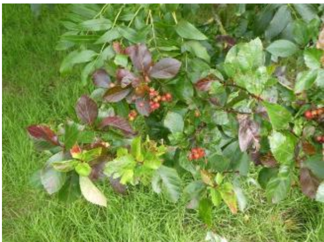
Cotoneaster for bird food