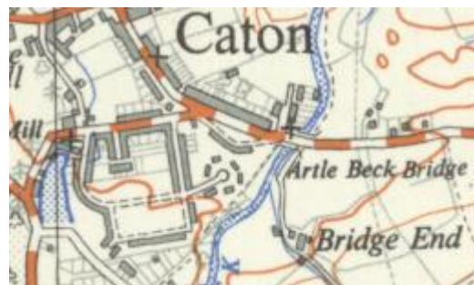
1952 The Fell View area council houses have been built and Becksid is marked