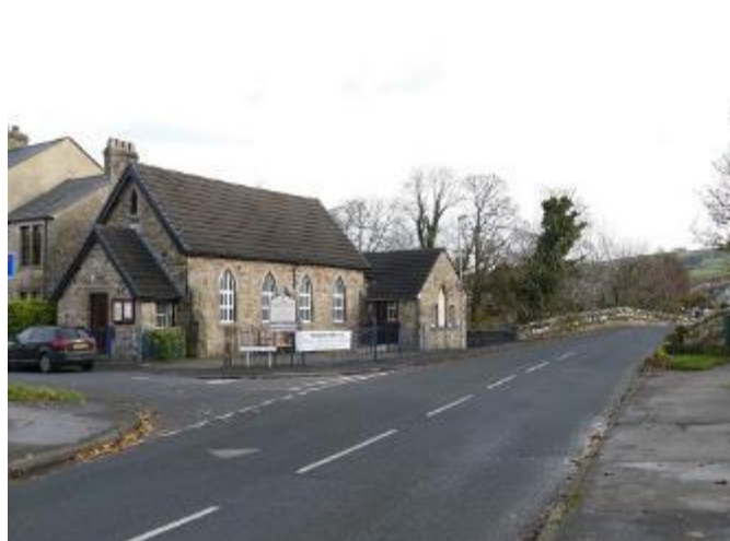
Baptist church viewed from Beckside with Artlebeck