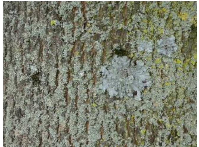
Lichen, sign of fresh air and longevity