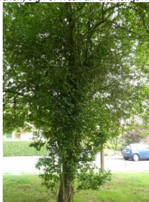
Hawthorne for bird food