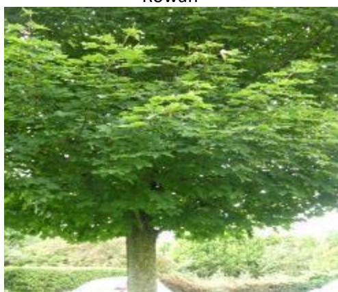
Plane in dense summer leaf