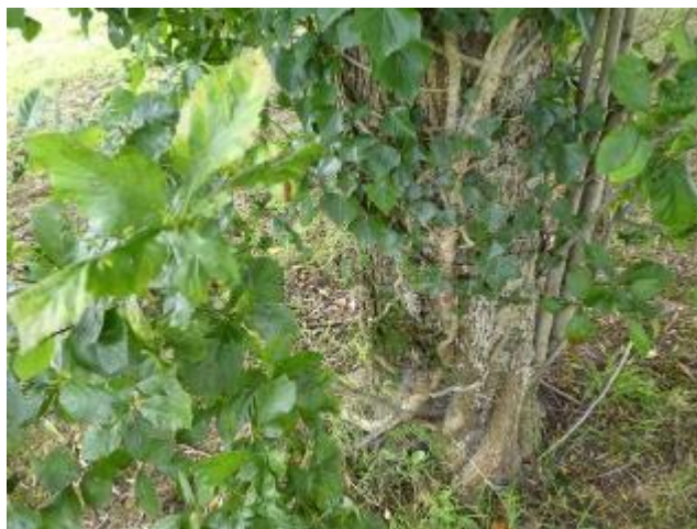
Ivy, messy twigs and leaves for wildlife at ground level