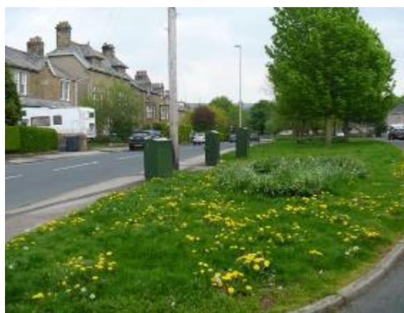
Attractive dandelions take over.