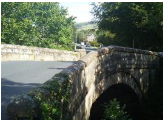
The narrow hump backed Artlebeck bridge