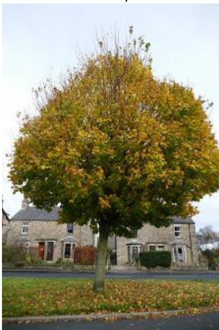
The autumn plane retains leaves well into winter