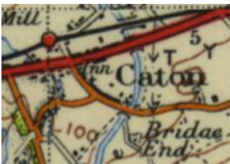
OS 1945-52 No sign of Becksid

Historically Becksid was part of a field by the main route between Lancaster and Kirkby Lonsdale until the A683 was built. The creation of Becksid dates back to the post war building of the council house estates centred on Fell View.