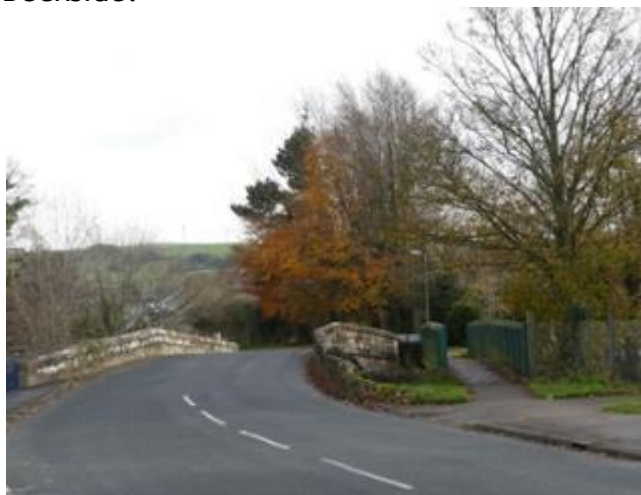
Looking towards Brookhouse from Beckside, over

Beckside, because of its location, is the most well-known and prominent of the local green spaces which the neighbourhood plan seeks to designate. Location underpins the special value to our community. All road traffic between the villages of Caton and Brookhouse travels past Beckside on Brookhouse road, so the type of traffic depends on the time of day. Commuter traffic goes out past Beckside from all the villages in the parish, whether turning off on Copy Lane to Quernmore and the 'back road' to Lancaster; or continuing towards Caton village centre and the A683 between Hornby and Lancaster to join the M6 or east towards Kirkby Lonsdale. School traffic is heavy at drop off and collection times for the popular St Pauls school in Brookhouse, with a high proportion of families with prams, scooters or bicycles passing Beckside.