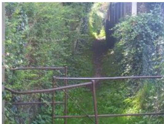
Footpath from Beckside to Parish Woodland Local green space; Caton Community Primary School; Broadacre

The grass is maintained by the Parish Council, but in spring it bursts into sea of yellow as two massed areas of daffodil come into flower, followed later at the north end by a splash of dandelions. The daffodils are a much loved feature.